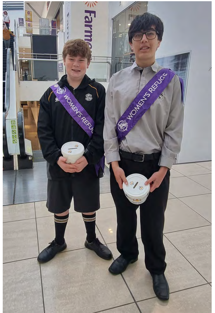
Thank you for your support Taranaki